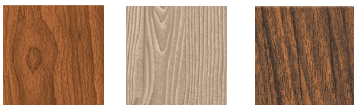
Different Wood texture